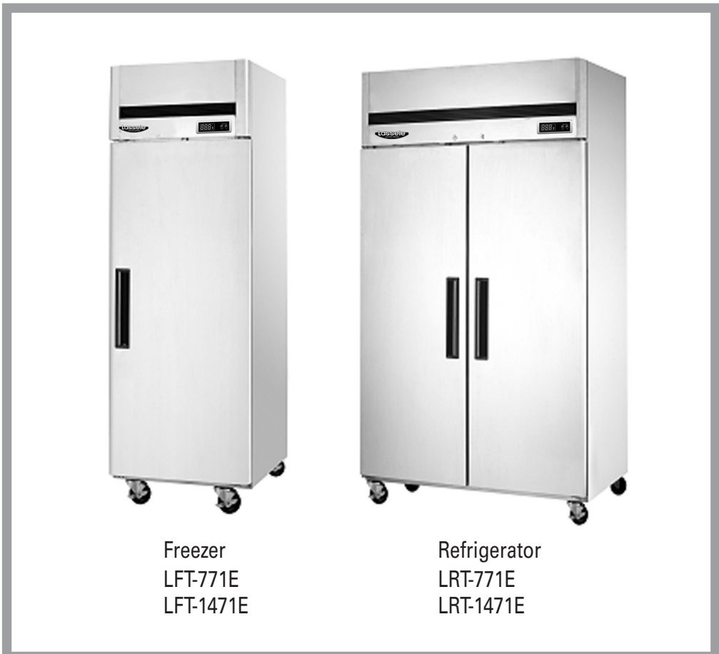
Freezer LFT-771E LFT-1471E

Please read this manual completely before attempting to install or operate this equipment!